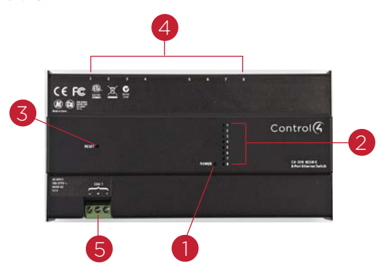
Figure 1. Front View